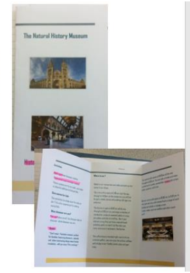
You can see more on our class website page.

In topic, Year 5 have been studying Ancient Greece. They made Greek Vases out of paper mache and decorated them after learning about why and what they were used for and what designs they had on their vases.